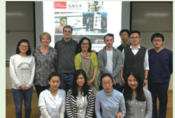
Collaboration with British researchers

One of my favorite things about Japan is Japanese food. The food is made from fresh ingredients, has good natural flavors, and is beautifully presented. I enjoy improving my delicate sense of taste through Japanese food, which was listed as an entity in UNESCO's Intangible Cultural Heritage in 2013.