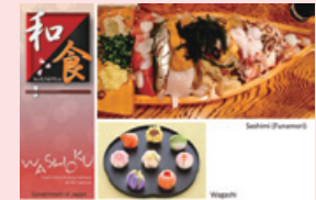
My favorite: Japanese food

I practice a round and straight philosophy: Round reader (read widely), straight speaker (speak simply), round eater (eager gourmand), and straight cook (cook simply). A spiral shape is formed by winding material straight and round, resulting in more flexibility and elasticity, helping you to spring up to higher ground in life. I am happy to share some of my wisdom gained through life experience: "Enjoy hardships to polish will, enjoy competitive relationships to polish sense, and enjoy friendships to polish heart." As someone who is constantly learning, I believe that "Today I am a reader, tomorrow I will be a leader!" Life with science is wonderful!